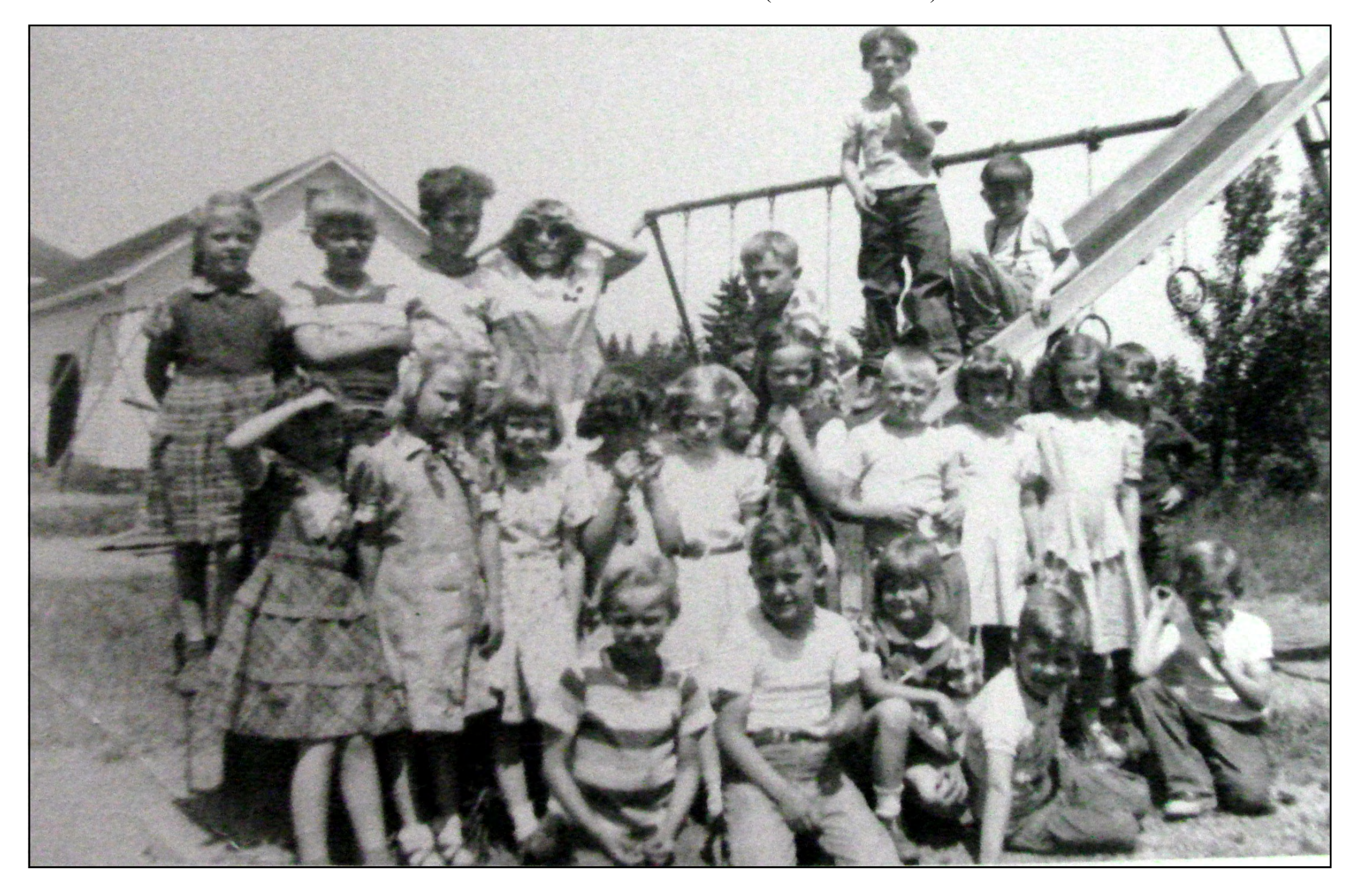
Bonus Photos from Hockinson (unknown details)